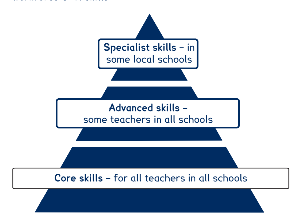
Figure 5: Removing Barriers to Achievement: developing school workforce SEN skills

4.3 The first section of this chapter looks at what is already in place to develop these three levels of skill for helping children overcome literacy and dyslexic difficulties. It also proposes what more might be done to better enable schools to advance the progress of children with literacy and dyslexic difficulties.